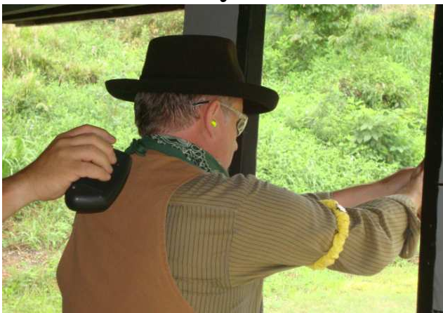
Wells Fargo Slim