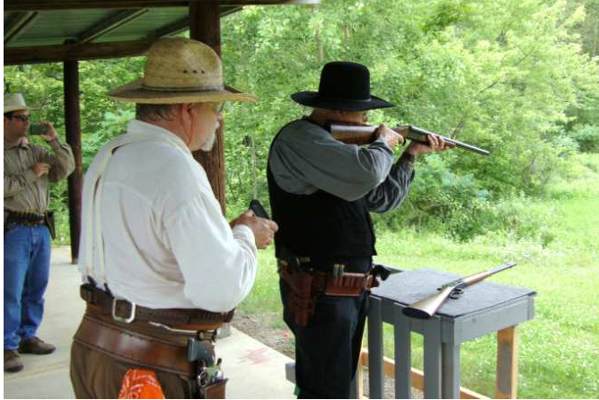
Life-R and WoodCutter