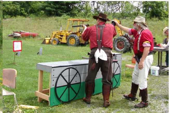
Rowdy Red Tailor and Moosetracks