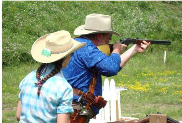
Sage Chick and Sandy Creek Jake