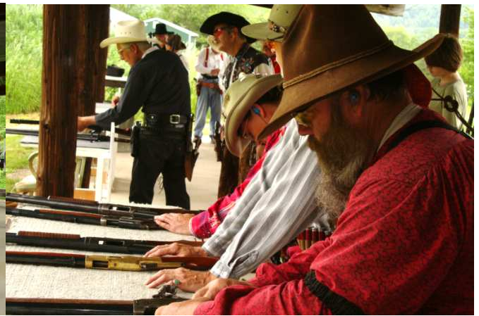
Stone Creek Drifter