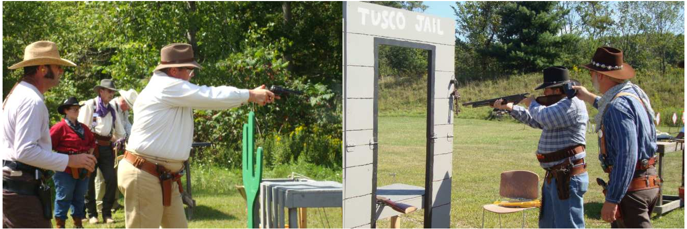
One More Woody