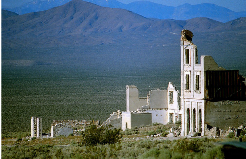
Ruins of the Cook Bank building in Rhyolite, Nevada

There were over 2000 claims covering everything in a 30-mile area from the Bullfrog district. The most promising was the Montgomery Shoshone mine, which prompted everyone to move to the Rhyolite townsite. The town immediately boomed with buildings springing up everywhere. One building was 3 stories tall and cost $90,000 to build. A stock exchange and Board of Trade were formed. The red-light district drew women from as far away as San Francisco. There were hotels, stores, a school for 250 children, an ice plant, two electric plants, foundries and machine shops and even a miner's union hospital.