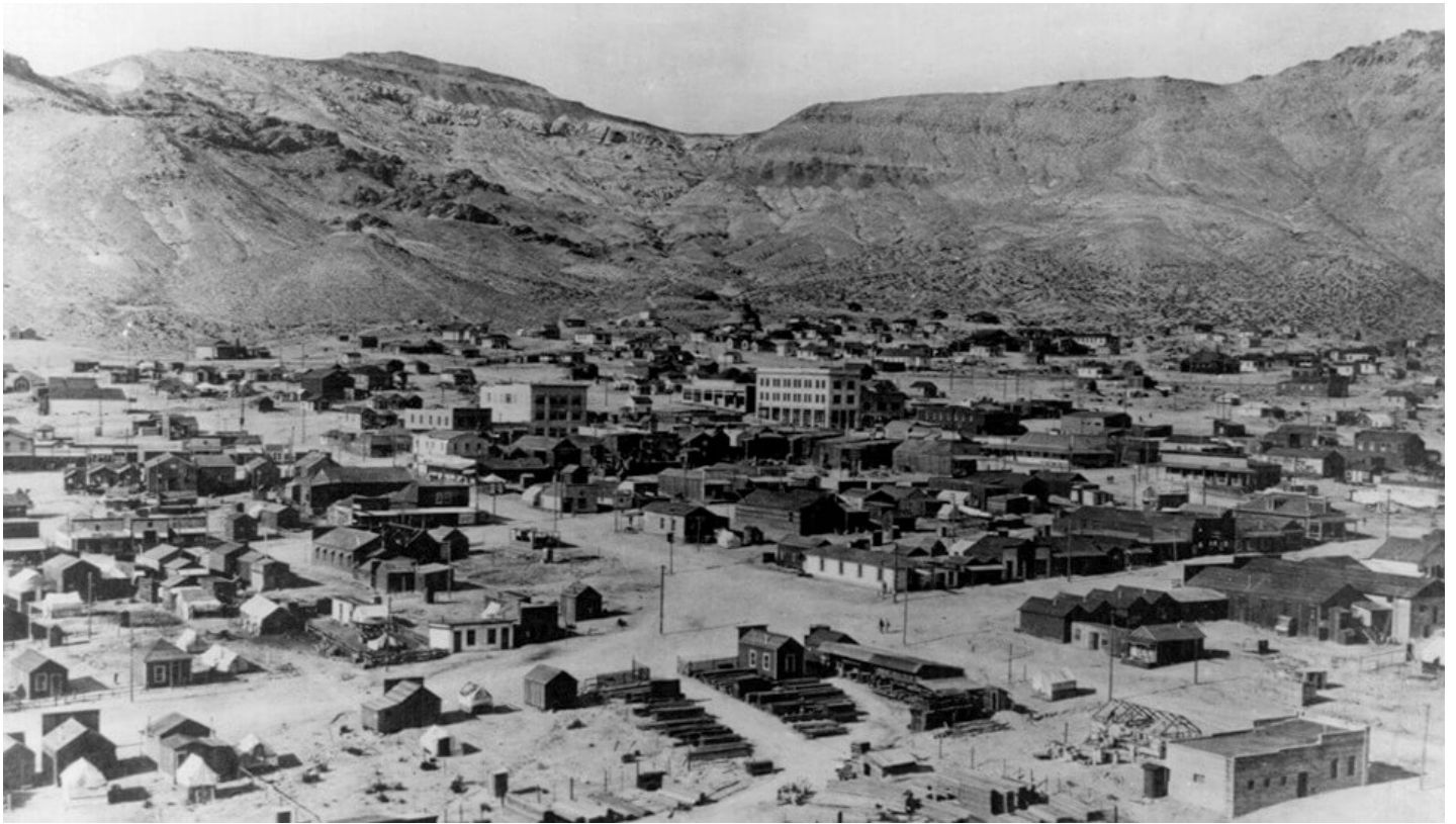
Bullfrog Mining District