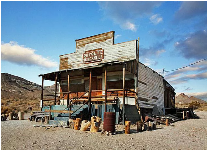
Rhyolite, Nevada, became a popular filming location after it went belly up in the 1920s.

With populations rarely topping a couple hundred, most gold rush settlements went bust before they could truly get big. The town of Rhyolite, on the fringe of Death Valley National Park in Nevada's Bullfrog Hills, is a notable exception. As many as 5,000 people, most working in the nearby Montgomery Shoshone Mine, resided in the now-forsaken town during its peak around 1907 to 1908. Aside from a relatively significant population, Rhyolite is also exceptional for the speed with which the bustling community went belly up.