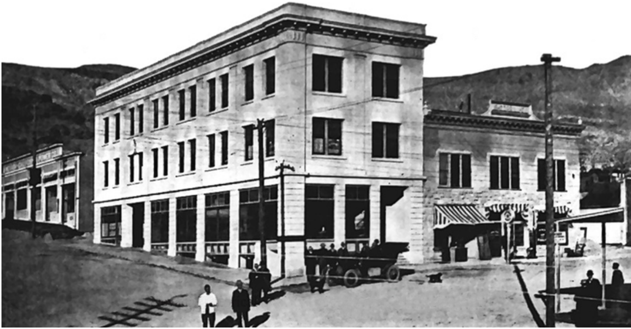
The Cook Bank Building in 1908